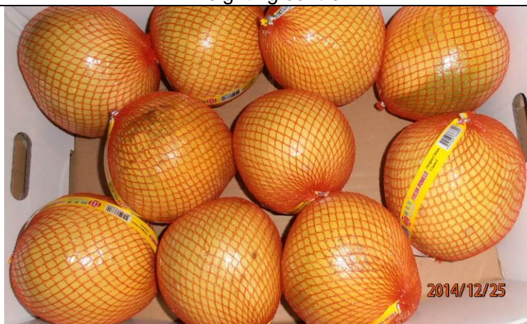
Checking of quality