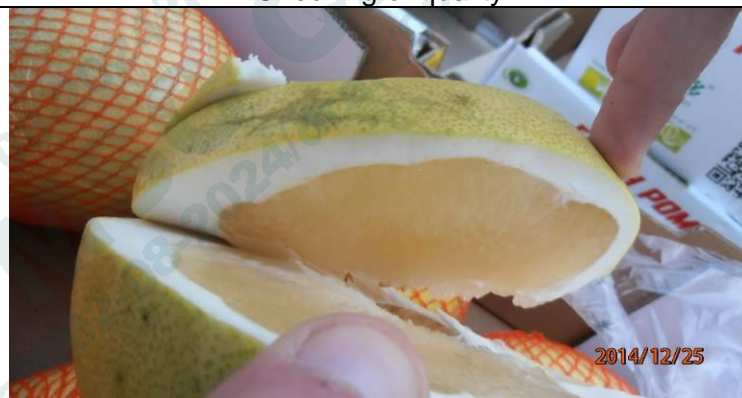
Visually checking the quality