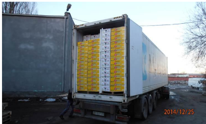
View of cargo before discharge