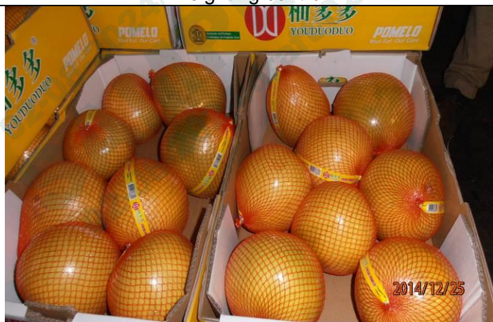
Checking of quality