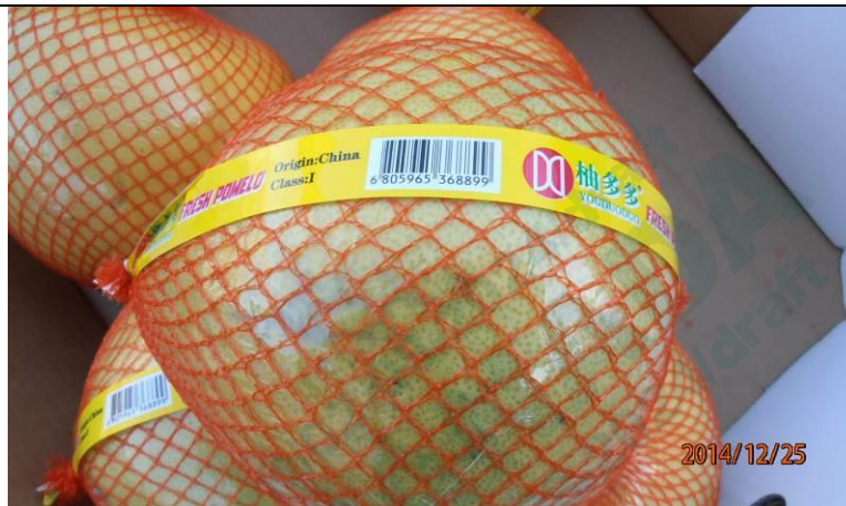
Checking of quality