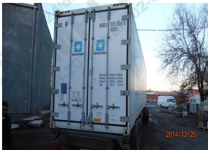
View of container MNBU3050550

The following photos were taken during the inspection: