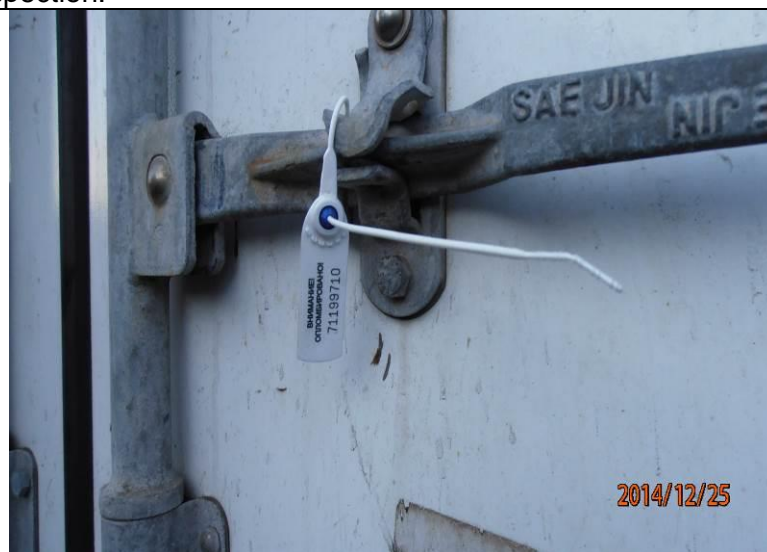
View of seal