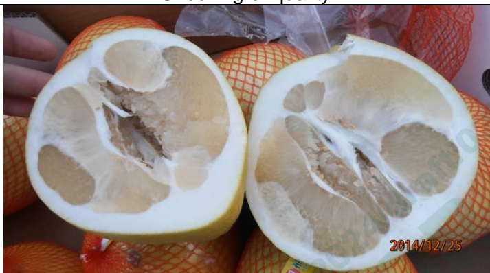
Checking of quality