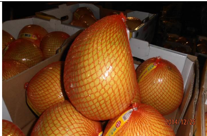
Checking of quality