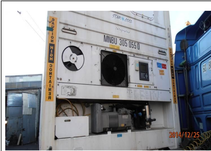
Checking the temperature sensor